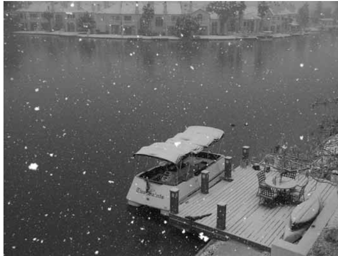
Snow Storm at The Lakes, January 7, 2005