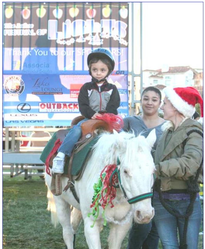
Free Pony Rides are always a big hit!