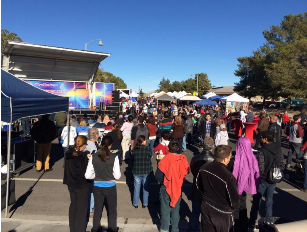
There was a huge crowd at the 2013 Lakes Festival of Lights